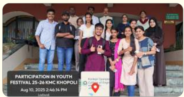
PARTICIPATION IN YOUTH FESTIVAL 25-26 KMC KHOPOLI Aug 10, 2025 2:46:14 PM