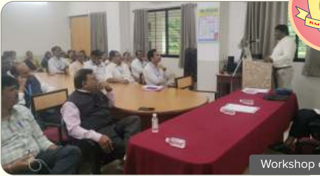
Workshop on NAAC & NEP