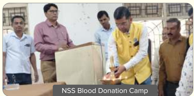
NSS Blood Donation Camp