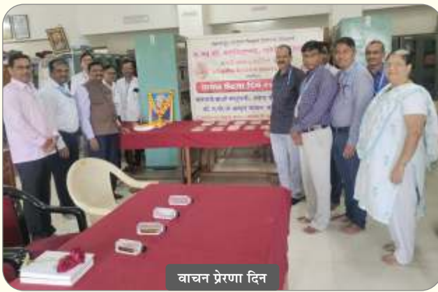
वाचन प्रेरणा दिन