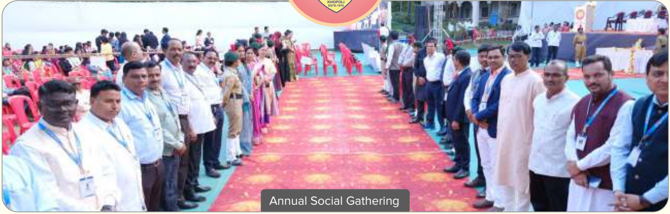
Annual Social Gathering