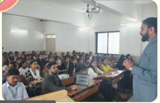
Student's Seminar - Commerce Association