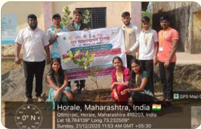
Horale, Maharashtra, India 06mj+jxc, Horale, Maharashtra 410203, India Lat 18.784139° Long 73.232509° Sunday, 21/12/2025 11:53 AM GMT +05:30