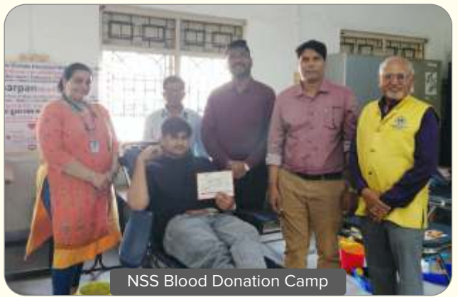
NSS Blood Donation Camp