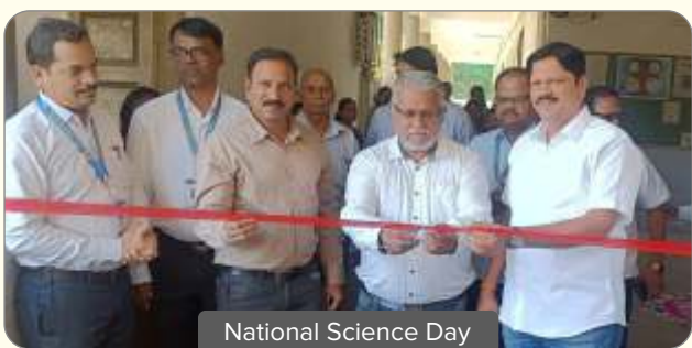
National Science Day