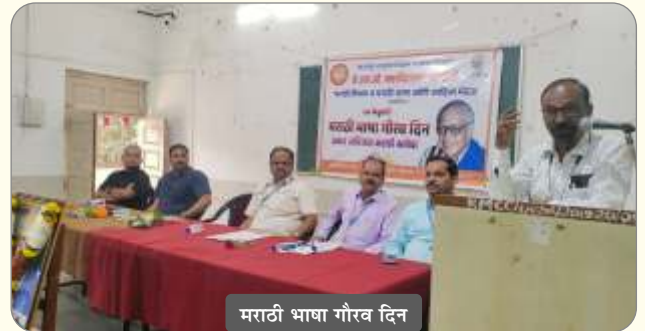
मराठी भाषा गौरव दिन