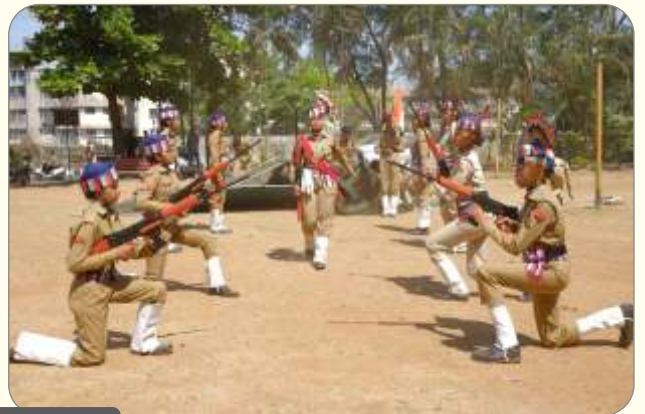
National Cadet Corps