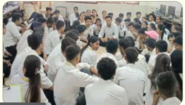
Computer Science - UBICOM