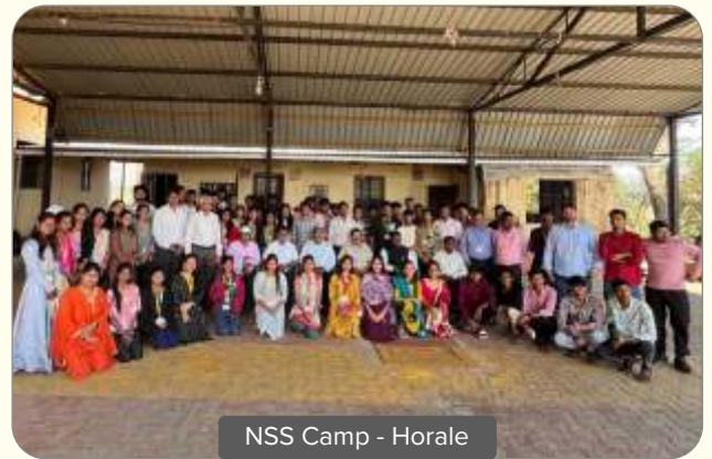
NSS Camp - Horale