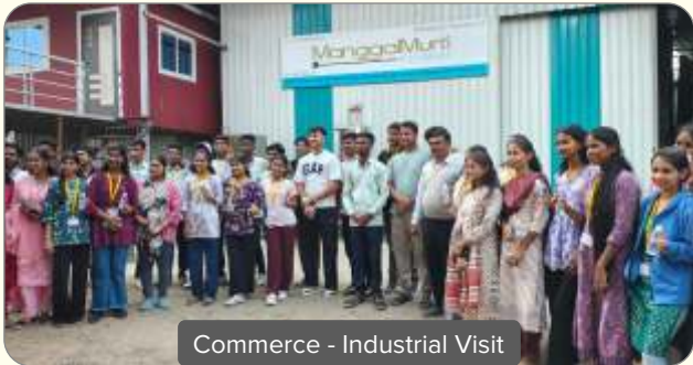
Commerce - Industrial Visit