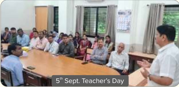
5 th Sept. Teacher's Day