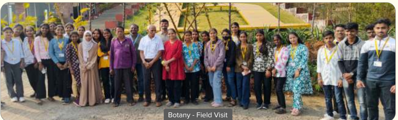
Botany - Field Visit